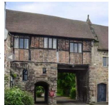
Polesworth Abbey Gatehouse