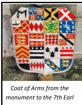
Coat of Arms from the monument to the 7th Earl

In the 1980s the complete correspondence section of the archives for the period 1477 to 1828 was copied on to 39 reels of microfilm. These cover the whole range of the life of the Hastings family and range from letters from monarchs from Henry VIII onwards to domestic matters.