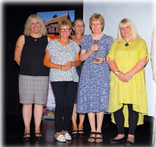
Left: Members of the team on stage with the trophy for Heritage Group of the Year.