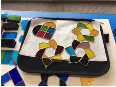
Stained Glass Window Experience