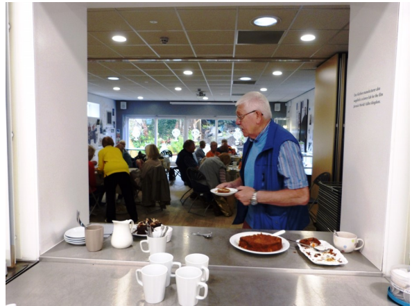
Not much cake left! Keyworth U3A visit in July.

Next week, we will be welcoming Smisby WI for an evening tour of the Church followed by cheese and wine in the Heritage Centre.