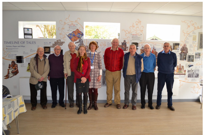
Packington Men's Group visit