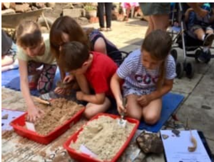
Left: Archaeology Day