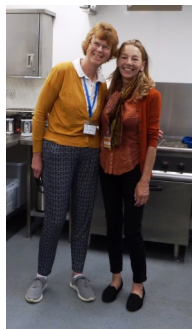
Tour staff - still smiling

If you know of a group of people who would like a tour of the Church, or a talk about Church and Heritage Centre, please don't hesitate to contact Sharn for details.