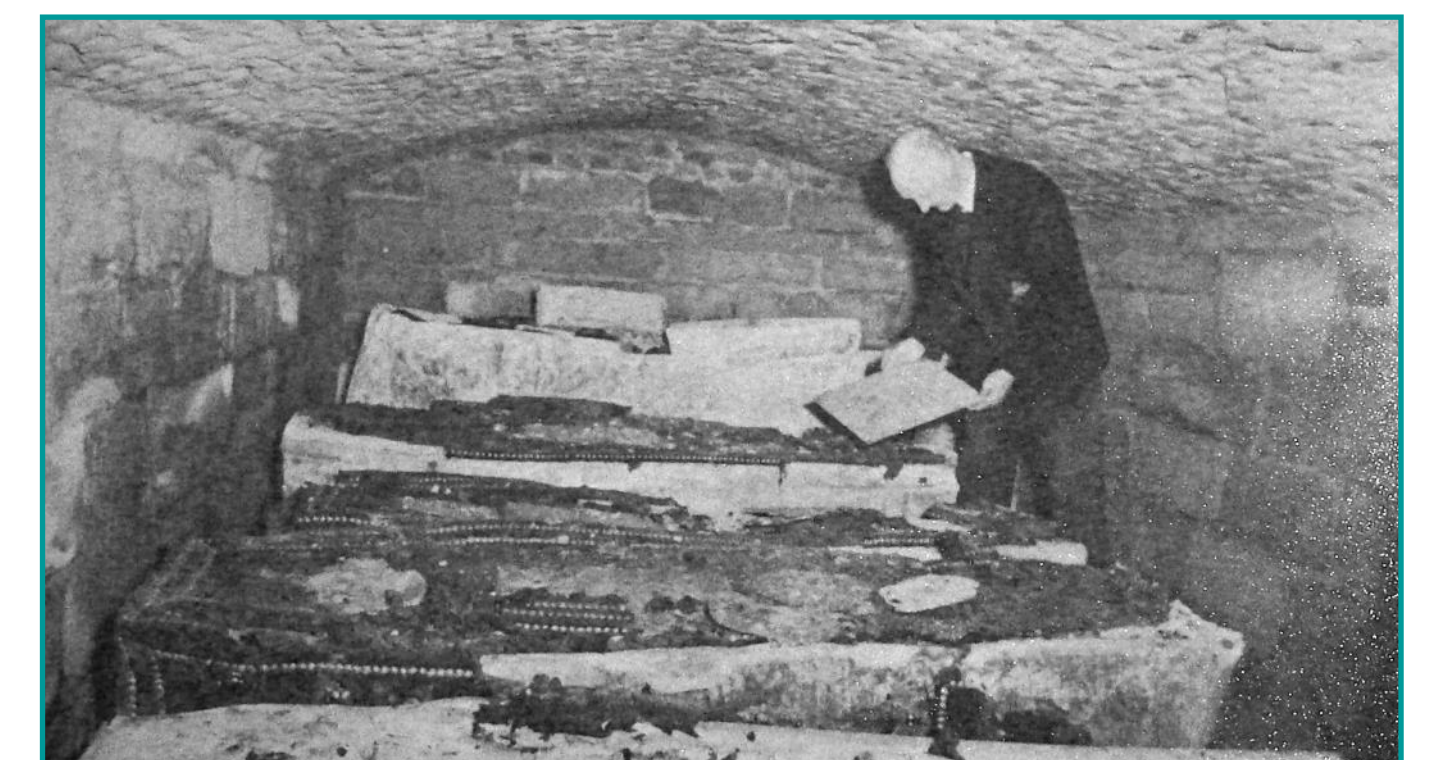
An archive image from the mid 20th Century, showing a visitor inspecting coffins in the closed vaults beneath the Hastings Chapel.