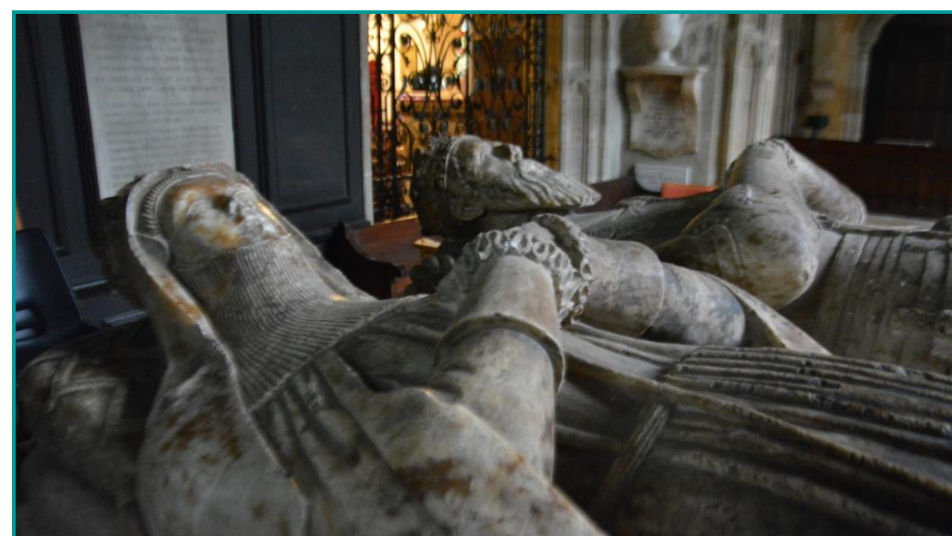
Catherine's great-grandfather, the Duke of Clarence, who allegedly drowned in a vat of malmsey wine, was brother to English kings Edward IV and Richard III.