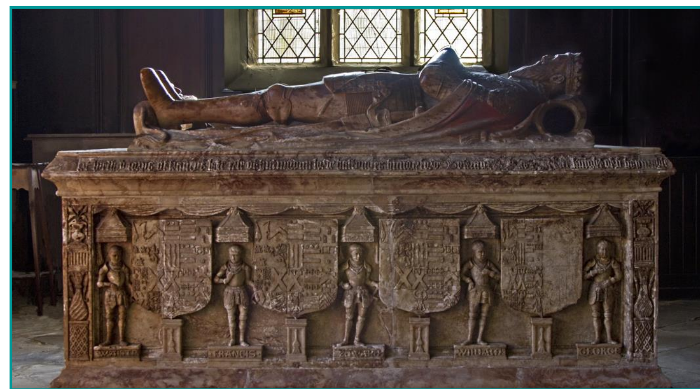
Henry Hastings, the 3rd Earl of Huntingdon, erected the tomb to his parents, Francis (1514-1561) and Catherine (1511-1576). Catherine was born Catherine Pole, great grand-daughter to George Duke of Clarence.