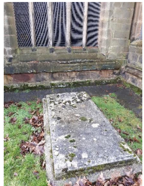
Grave of the 14 th Earl of Huntingdon

The most recent monument in the churchyard dates to 1939 and is an unassuming limestone ledger stone tucked into the north side corner where the chancel meets the Hastings Chapel. It marks the grave of the 14 th Earl of Huntingdon, Warner Francis John Plantagenet, the last descendent of the Hastings family to be buried at St Helen's.