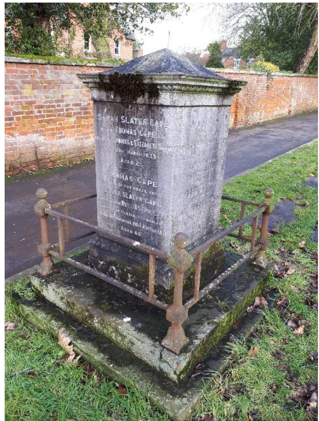
The Cape family monument