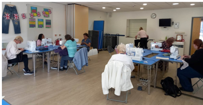
Sewers hard at work

We are delighted by the response to our 'Sew It, Don't Throw It'