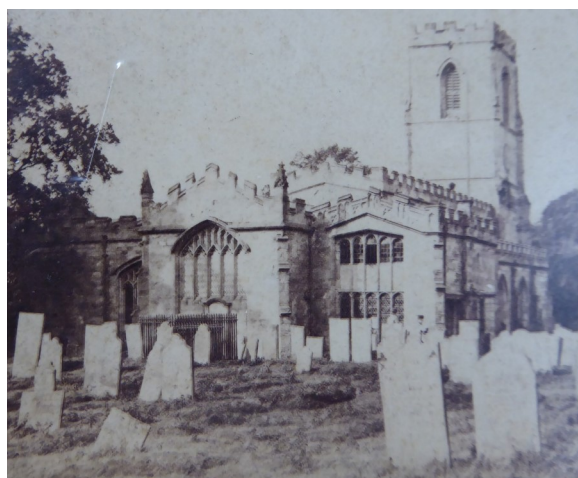
Graveyard prior to stones being laid flat in 1880