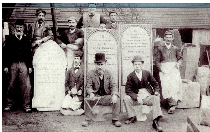
Some of the stone carvers