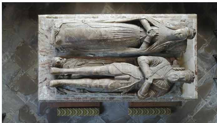
Tomb of the 2nd Earl of Huntingdon and his wife, Katherine Pole

The 2 nd Earl was a Knight of the Garter and during his lifetime his Garter banner would have hung in St George's Chapel, Windsor. The 1980 edition of the St Helen's Church Guide says that it is this banner which hangs from the ceiling of the Hastings Chapel. If this is so, it has been there since 1560 which would explain why it is so threadbare today.