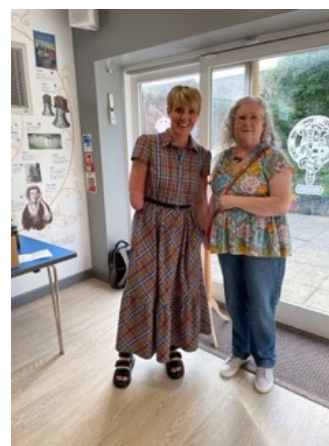
From left to right: some of our sewers with their aprons made from recycled textiles & glasses cases.