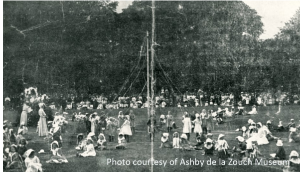
A Maypole Event On Bath Grounds With North Street Infant School Morris And Maypole Dancing On June 22nd 1911.

According to folklore, 1 st May is the first day of summer. One of the many traditions associated with this day is that dancers and others climb the nearest/highest hill before dawn on May Day and await the sunrise. At that time of year in Leicestershire, this will be a couple of minutes after 5.30. As the sun comes up, they will dance and sing traditional May Day songs to welcome in the summer.