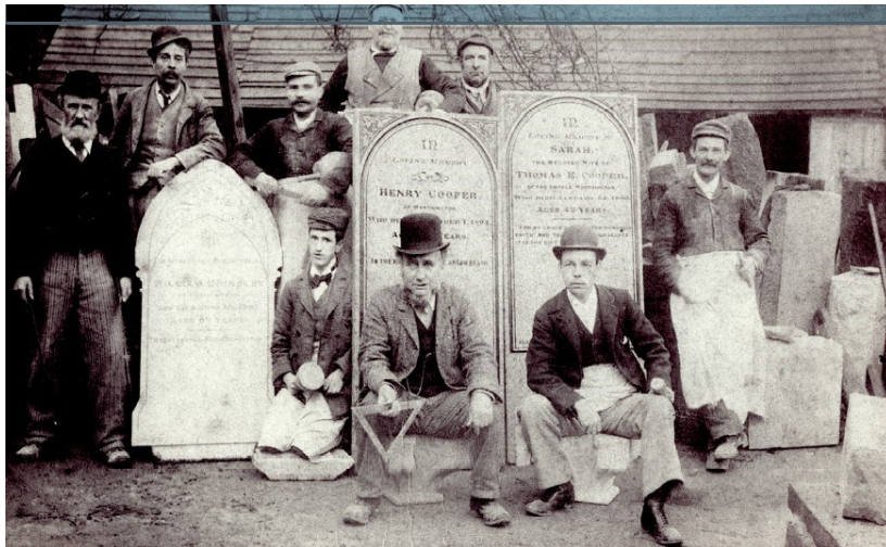
Late 19th Century gravestone carvers pose for a photograph.

Our brand new churchyard tour this July is part of our ongoing 'Churchyard Stories' project, which aims to uncover more stories about people who have lived in our town over the centuries.