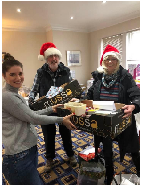
Last year, delivering gifts from the Flagstaff family of churches

In the meantime, those who don't have friends or family to support them are fed and given basic accommodation by the Home Office, but having arrived with nothing but the clothes they are wearing, their allowance of £8.86 per week per person, which doesn't cover many pairs of socks, or even basic necessities - certainly doesn't stretch to toys or gifts for their children!